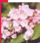
State Flower Mountain Laurel