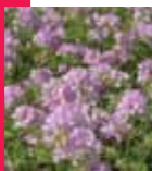
State Plant Penngift Crownvetch