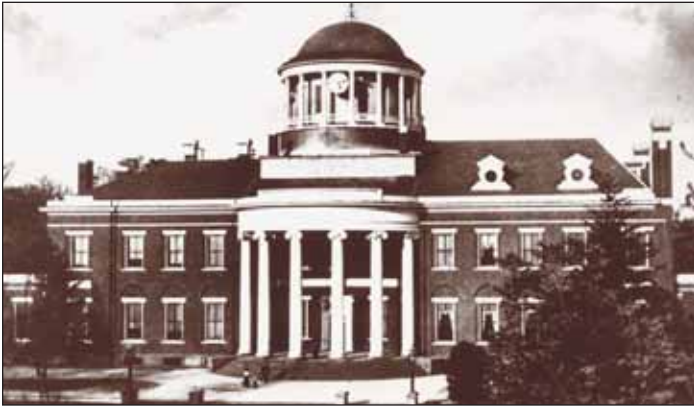
Harrisburg has been the capital of Pennsylvania since 1812. The main building of the original Capitol, pictured here, was destroyed by fire in 1897.